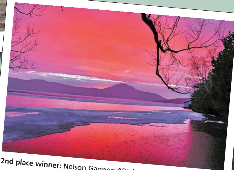
2nd place winner: Nelson Gagnon "Pink Sky"