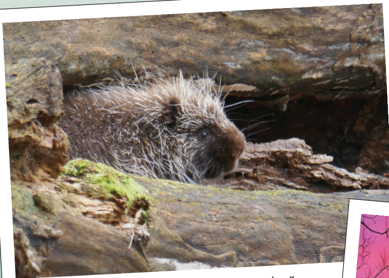
1st place winner: Penny Farfan "Little Porcupine"